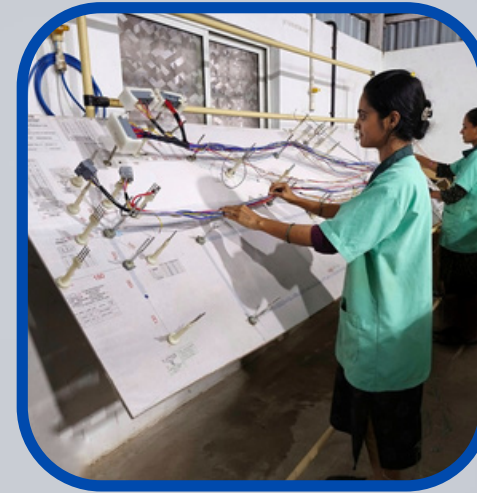
Systematic Assembly Operations: Specialised board-based harness laying