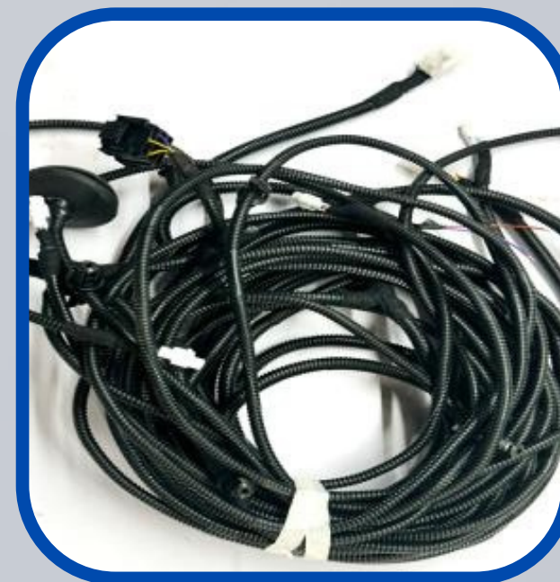
Controller Wiring Harness