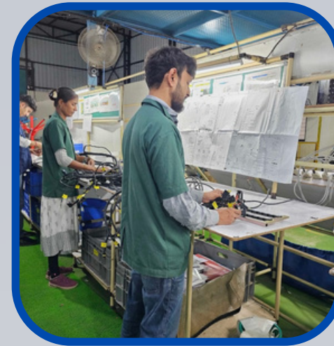
Customer Receipt Inspection: Ensuring Every Product Meets Customer Expectations