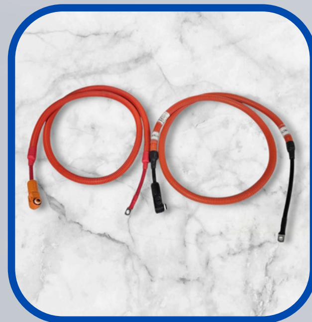
High Voltage Battery Cable