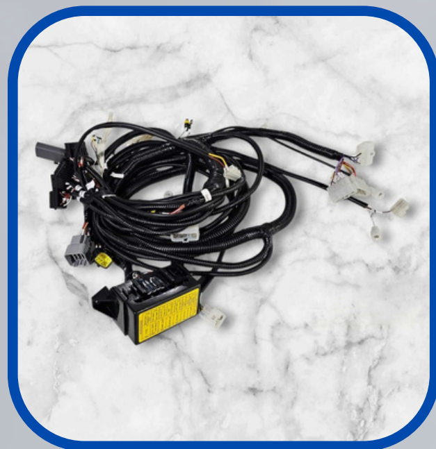
Meter Panel Integration