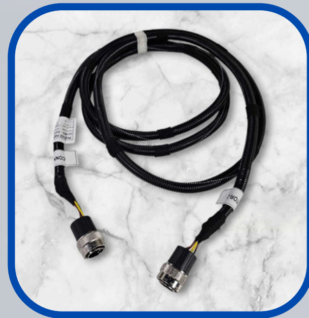
Battery To Battery Harness