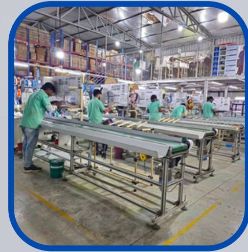
Precision Wire Processing: Automated cutting, crimping, and sealing