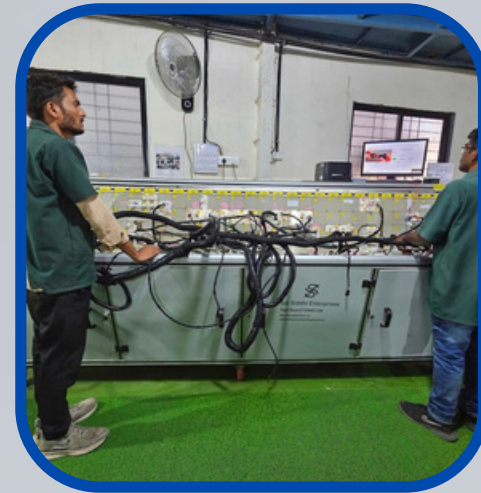
Advanced Quality Validation: Automated circuit testing with sophisticated detection