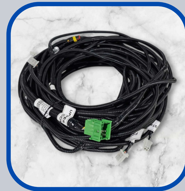
Salon Lamp Harness