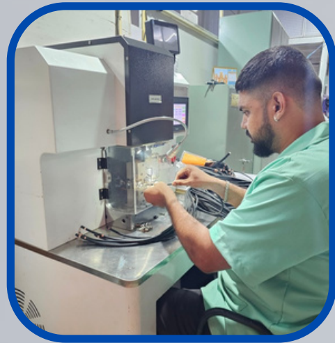
Advance HV Cable Processing: Fully Automated HV Battery Cable Crimping